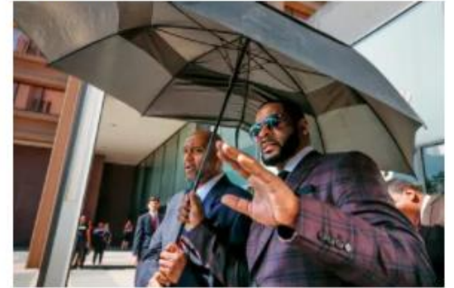
R. Kelly Trial Opens: 'This Case Is About a Predator'

Left, NYT.com 101421; center, NYT.com 092121; right, NYT.com 081821