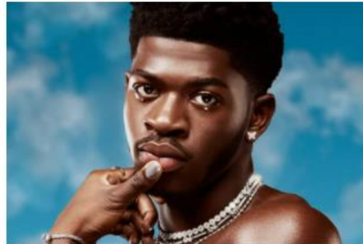
Lil Nas X Reveals Himself on 'Montero'